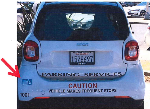
Driver's Side Rear Bumper

This permit may be displayed on the exterior driver's side rear bumper or inside on the driver's side rear window. The license number for the vehicle is written on each permit and is non-transferable.