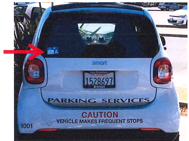
Driver's Side Rear Window

Ponga el permiso de estacionamiento en el defensor trasero o en la ventana trasera del automovil del lado del conductor.